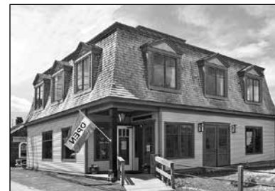
[5] Deer Isle Artists Association Gallery & Due North LLC Land Surveying and Mapping Services