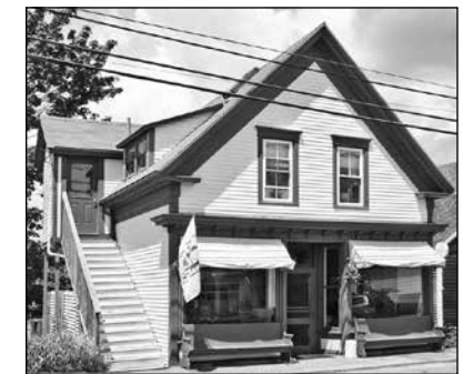
[7] 44 North Coffee Main Street