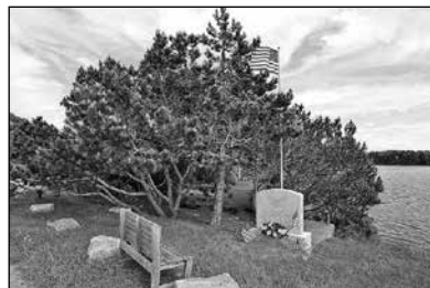
[2] Historic Deer Isle Town Hall & Veterans Memorial Park