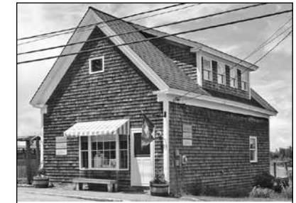
[6] Summerall / Mozelle Gallery Main Street

In its early years, the building was owned by L. Dramis, and later, Cora Beck Torrey sold millinery and dry goods. Subsequently the building housed a fish market, barber-